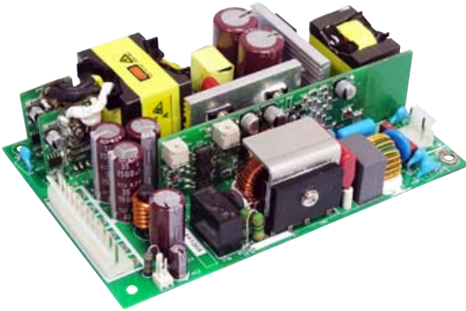
4" x 6" x 1.38"