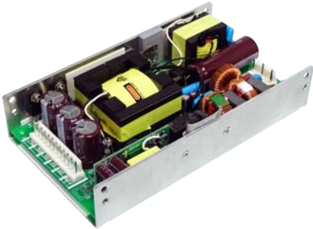
3.7" x 6.6" x 1.38"