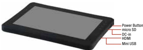
Power Button micro SD DC-in HDMI Mini USB