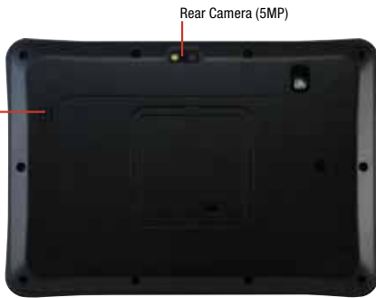
Rear Camera (5MP) Speaker