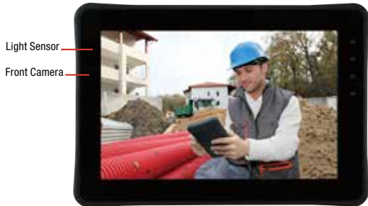
Light Sensor Front Camera

10.1" Rugged Tablet ARM-based Android™ with 1.0GHz Dual Core Processor