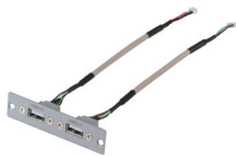
9761107600 RS-232/422/485 x 2