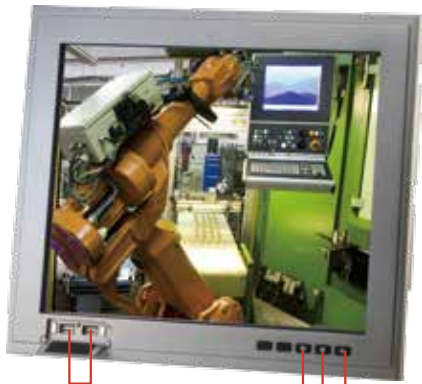
USB x 2 LCD On/Off Brightness + Brightness -

17" Rugged Fanless Touch Panel Computer With Intel® Celeron® 827E/ Core™ i7-2610UE Processor, 2 GB RAM